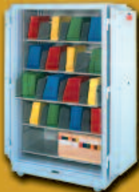
Record Safe offers optional side tab filing.