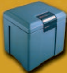
The MediaCase provides portable, safe storage for all media types.